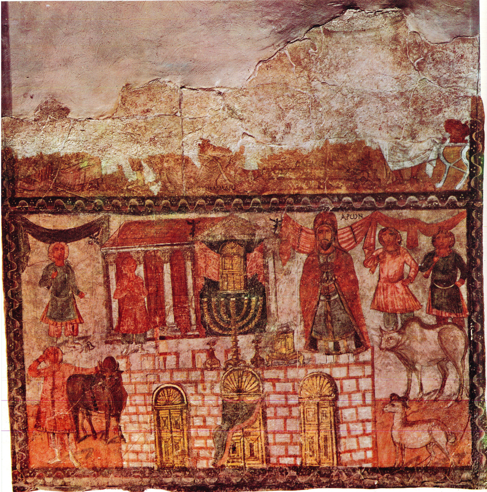
The Temple of Aaron (X, 4)