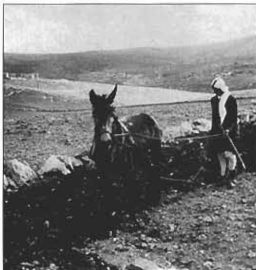
Fig. 4 - Traditional-style plowing along a linear terrace. The terrace and the parallel plowing reduce soil-erosion.

They were not level except for artificially irrigated terraces, where absolute level-