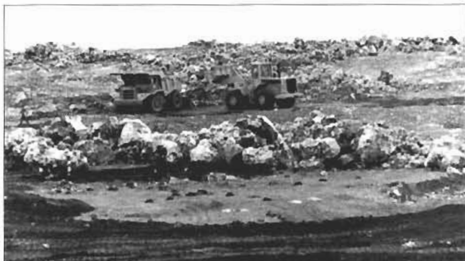
Fig. 6 - Modern development of a karst slope: heavy machinery uproots limestone blocks and transfers them to form arable patches of soil bordered by piles of rocks.

The ancient stone wall terraces are carefully built and are therefore labour-intensive. During the last centuries farmers concentrated on repairing old terraces rather than building new ones. Today another kind of terrace is replacing the ancient one. It involves heavy machinery instead of human work, and the terraces are wider, with piles of rocks along the edge of each terrace (Fig. 6).