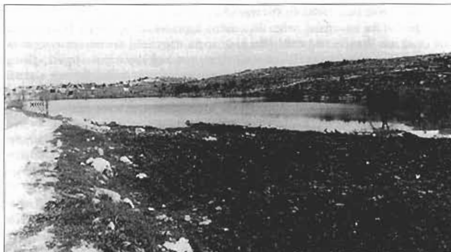
Fig. 2 - Karst depression 0.5 km long filled with water after winter rainfall (Beitunia, Judea). It is cultivated for vegetables and fruits.

development of the largest and most abundant limestone caves in Israel.