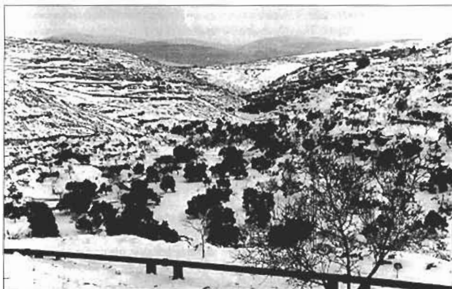
Fig. 3 - Olive groves on deep soils in a fluviokarst valley, and terraces on the adjacent slopes (Shomeron)

Decline of agriculture and re-establishment of the forest plants occurred during the second half of the second millennium B. P., as indicated by historical, archaeolo-