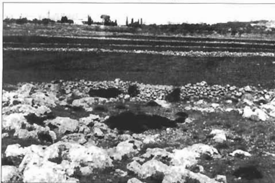
Fig. 5 - Summer view of a karst plateau over 'Aminadav Formation north of Jerusalem: A doline (foreground) where deforestation and agriculture took place in the past was invaded by Sarcopoterium spinosum (dark patches) when cultivation ceased. Wheat cultivation is still practiced at the larger karst depression filled with deep soil (background).

On the other hand, karstic carbonate rocks without marl intercalations, such as the 'Aminadav, Weradim, and Bi'na formations in the Jerusalem region, create a rugged karren topography promoting water infiltration into well-developed fissures and karst conduits. Consequently, terraces are less common on these karstic outcrops. Agriculture was developed in valleys and soil patches within the karren fields of these formations. Stones collected in these fields were used for building fences and watch towers, or just piled over protruding rocks (Fig 5).