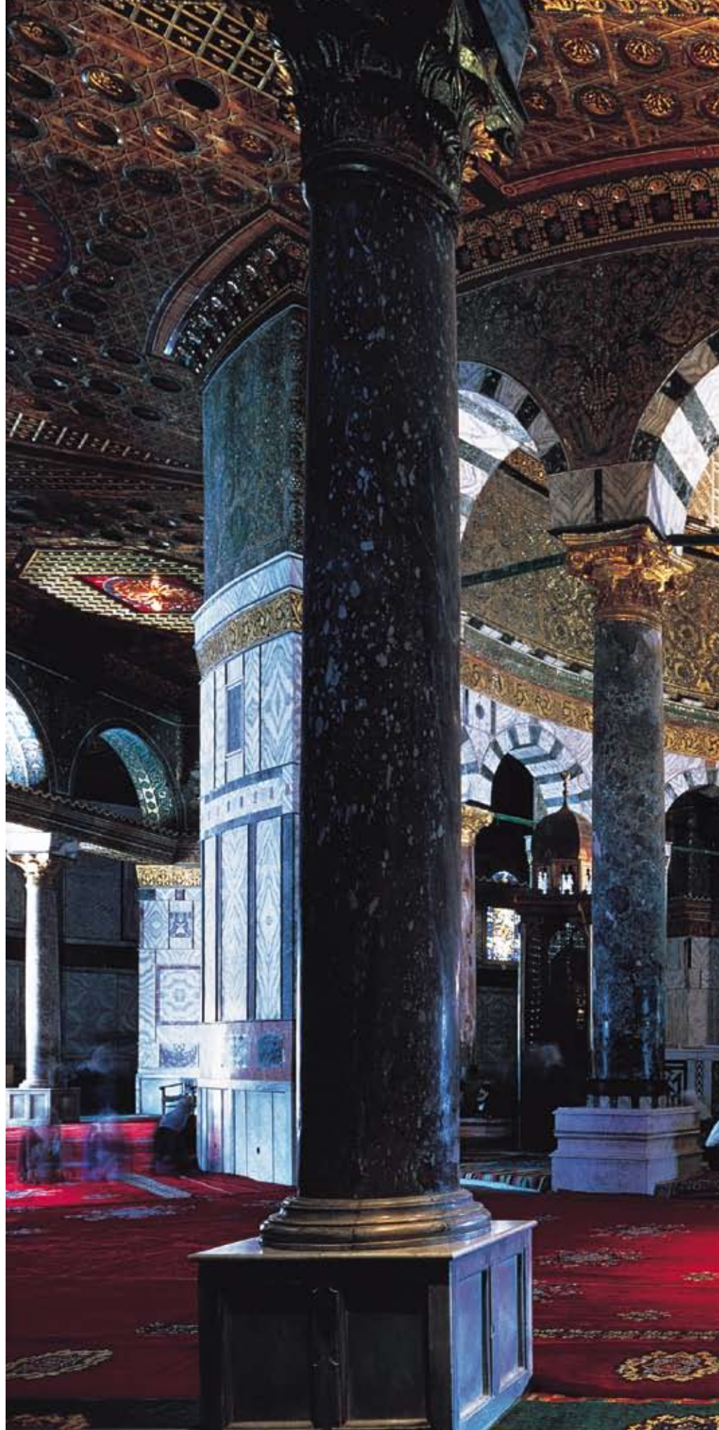
63 The interior of the Dome of the Rock