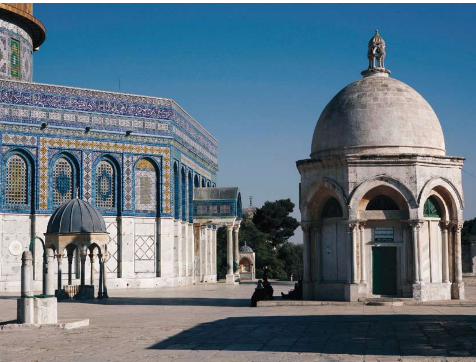
66 The minor domes on the Esplanade: minor holy places in a wider holy area

the monumental east gate. Prayer-niches multiply inside the Aqsa Mosque, in the minor mosques in the west, north, east, and southeast, and are even found in two minor domes on the platform [fig. 66]. All holy places now have prayer-niches and sometimes domes, lamps, and carpets—a rather inconsistent picture. Only the peak(s) of holiness, at first only the Dome of the Rock but later also the space of restricted access ( maqsurā ) inside the Aqsa Mosque, are marked by all four features: a prayer-niche, a dome, lamps, and carpets.