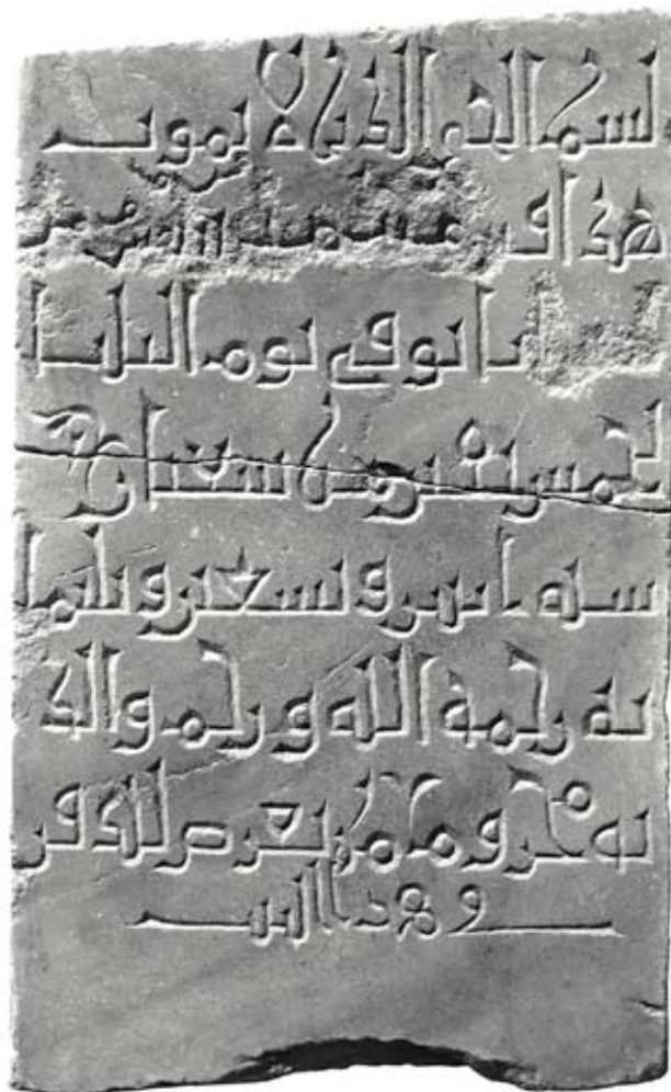
67 A tombstone of the Fatimid period, excavated ca. 1970 near Robinson's Arch. The deceased, whose name was deliberately effaced, died in 1002

The same holds true for the Jews . There is no doubt that the identification of the Haram with the Temple already implies its holiness, but this becomes more and more prominent.